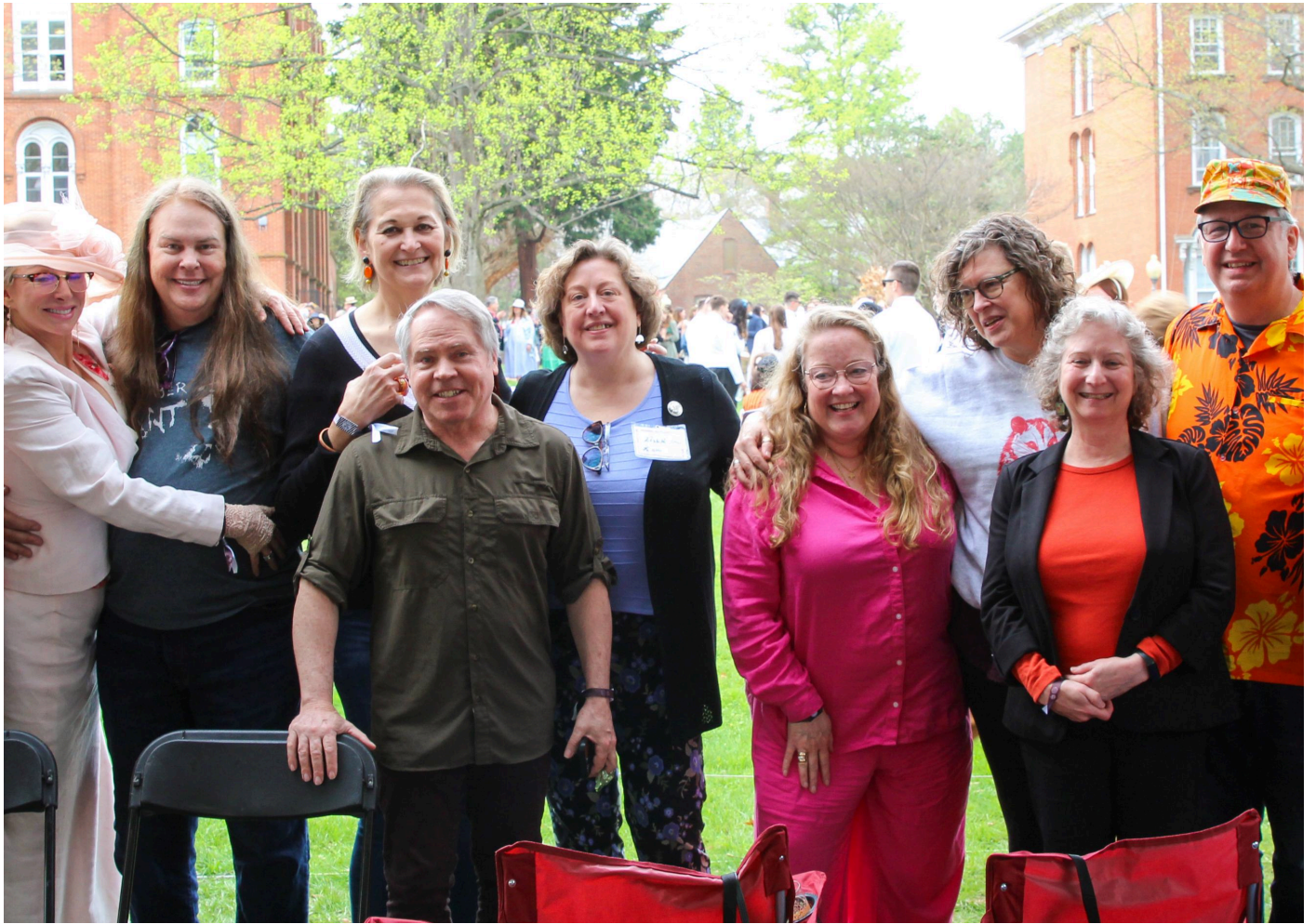
2023 Croquet Team