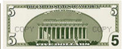
Lincoln Memorial, Washington, D.C.