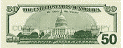
U.S. Capitol, Washington, D.C.