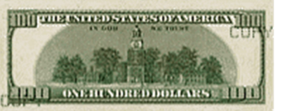
Independence Hall, Philadelphia, PA