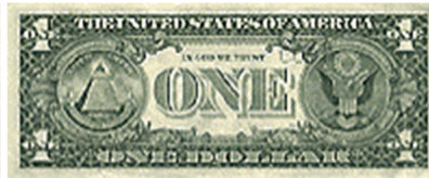
Great Seal of America