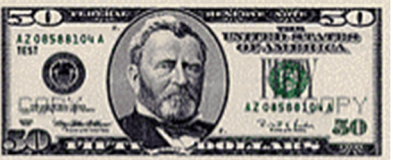
Ulysses S. Grant