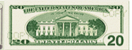
The White House, Washington, D.C.