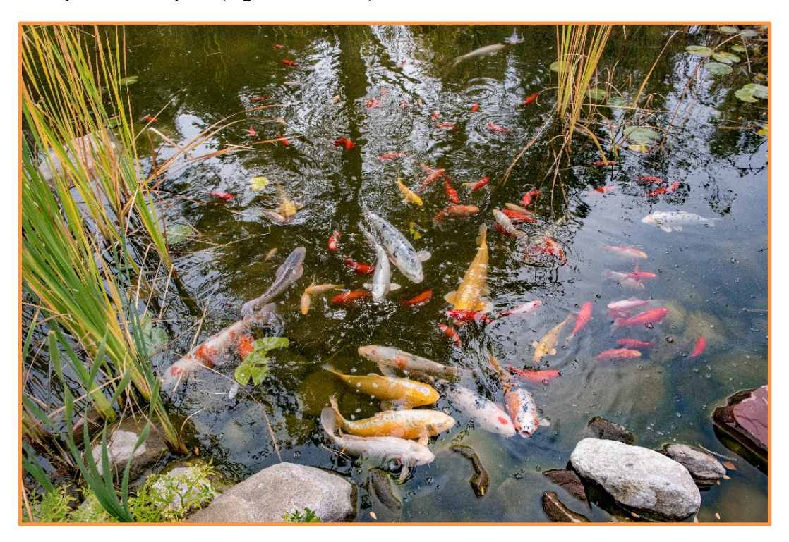
A Philosophy of Fire and Life Safety

Fire and life safety is one of the most important safety considerations at St. John's College. It is not just a minor program managed by a single administrative department. Rather, it is a complex system that concerns itself with the design and maintenance of the many structures that make up the college campus, as well as the behaviors of every student, employee, and visitor. Risk