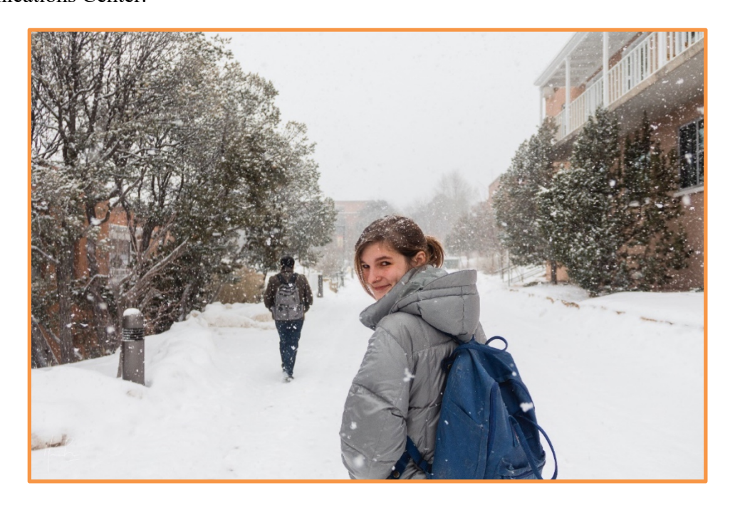
Clery Act Part III: Reporting, Procedures, Policy, and Notification Requirements

Note: For this Report, crimes within 0.5 miles of St. John's College (1160 Camino de Cruz Blanca, Santa Fe, NM) were considered occurring on public property and are recorded in Table 1: Clery Crimes by Definition by Source . The crime statistics for public property were supplied through a request made to the local public safety agencies via the Santa Fe Regional Emergency Communications Center.