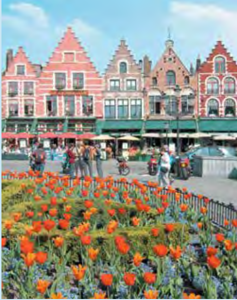
The lively, medieval Markt is the principal city square and gathering point in Bruges.