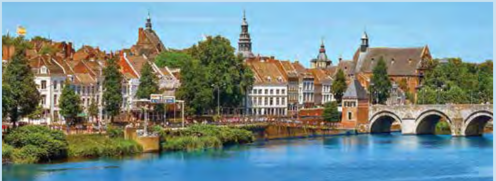
Photo below: Maastricht on the River Meuse is widely considered to be one of the oldest towns in Holland.

Cover photo: Cruise through Holland, where tulip blooms announce the arrival of spring.